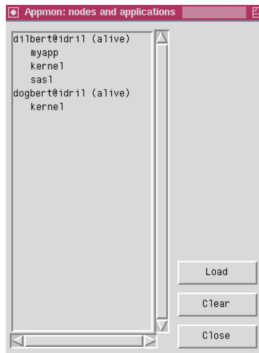
Figure 1.3: The Listbox Window.

The listbox window lists all nodes and applications. This window can be more easy to use than the normal, graphical user interface when the system consists of a large number of nodes and/or applications.