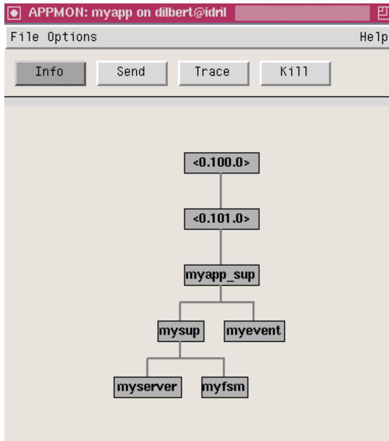
Figure 1.2: The Application Window.

The application can be shown either as a strict supervision tree, or as a process view with all linked processes. In supervision mode, the tree-gathering and -building algorithm assumes conformance to the OTP design principles.