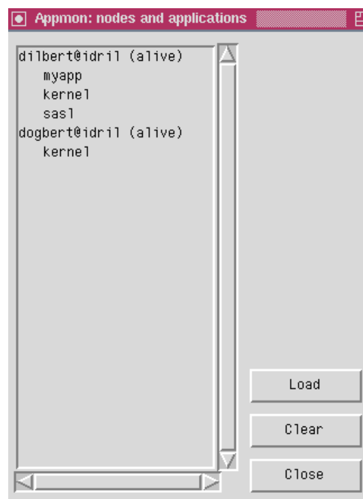
Figure 1.3: The Listbox Window.

The listbox window lists all nodes and applications. This window can be more easy to use than the normal, graphical user interface when the system consists of a large number of nodes and/or applications.